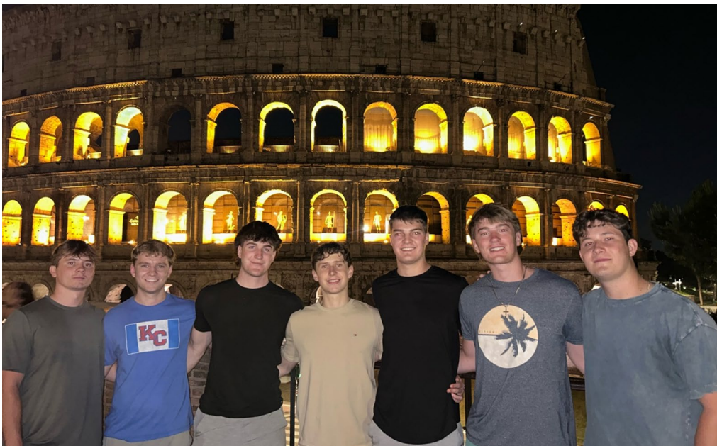
Brothers studying abroad this summer. They had an amazing experience!