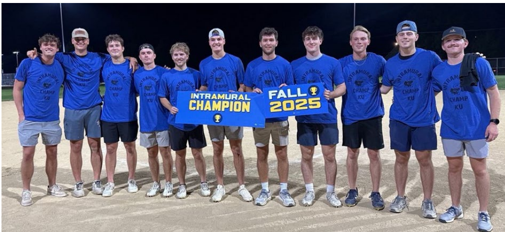
Our intramural softball team celebrates a first-place finish over SigEp. Congratulations to these men!